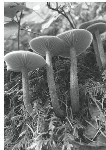
These mushrooms are a stunning pink - oh for colour printing!

This year we started our first MycoBlitz, a continuation of the spring BioBlitz that has seen us record approximately 1,200 species within Metchosin's borders. A MycoBlitz is an inventory of all the fungi species that can be found during a twenty-four hour period. About eighty keen mushroomers met with a number of experts to explore the Van der Meer property, Camp Thunderbird and Pearson College. The sorting and recording of the mushrooms was held at the Pearson College cafeteria (thanks Pearson College!) and many students were able to join in the excitement of the event. Although the final count is yet to be determined (mushrooms can be hard to identify), the estimate is an additional 200 species that can be added to the bioinventory. Certainly, a number of species were found