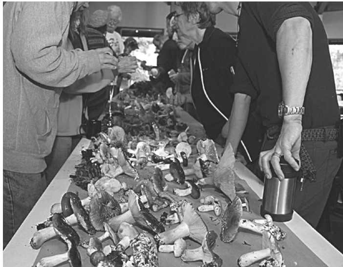
Micro BioBlitz – Yes, Metchosin had mushrooms!

2013 is being hailed as the best year for fungi in the last fifteen; the diversity of species and the abundance has had the mushroom world swooning with pleasure, with many larders full of bursting with an excellent harvest of chanterelles and hedgehogs.